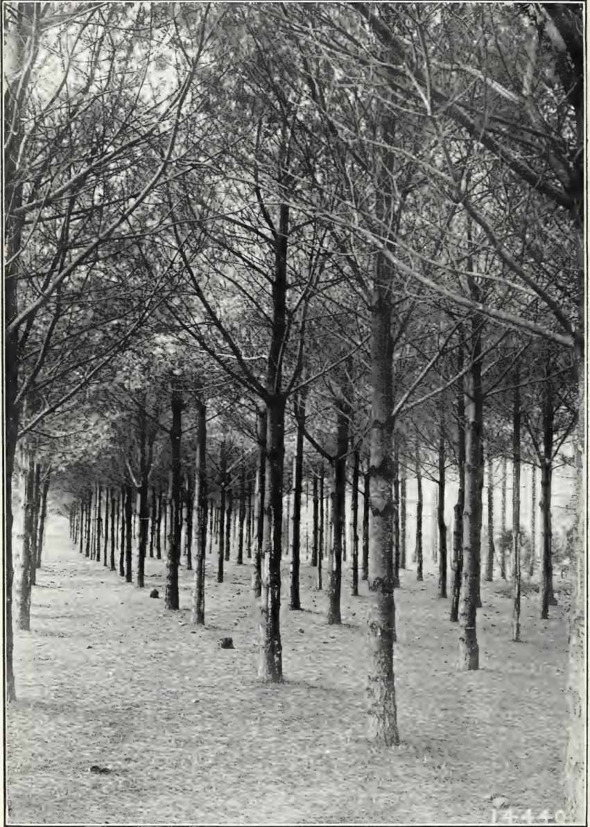
WHITE PINE PLANTATION, 22 YEARS OLD THINNED AT AGE OF 15 YEARS.